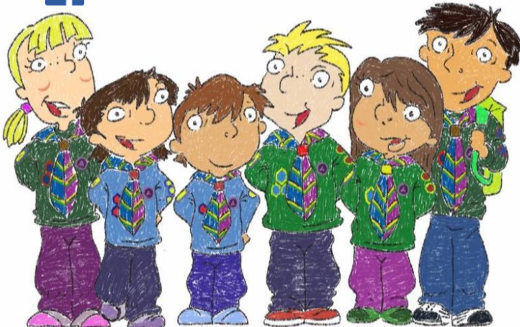
Produced for the 2020 Annual General Meeting of 30 th Lincoln (1 st Bassingham) Scout Group